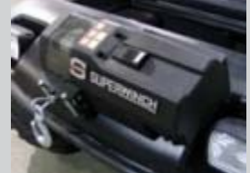
5400 WINCH WITH FAIRLEAD