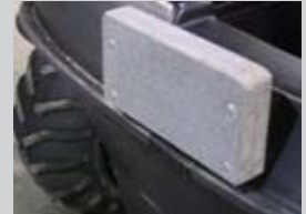
OUTBOARD MOTOR MOUNT